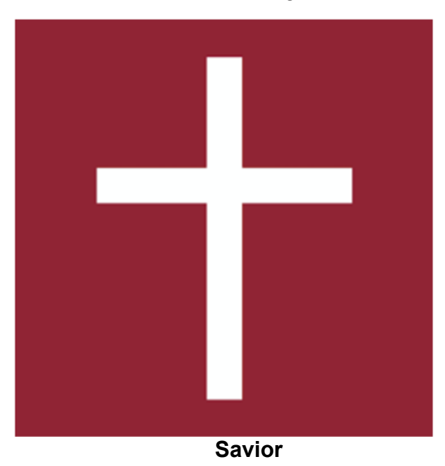
"But He was wounded for our transgressions, He was bruised for our iniquities: the chastisement for our peace was upon Him ..." -Isa. 53:5, KJV (Tit. 2:14, Isa. 55:7, Heb. 7:25, Isa. 1:18)

The name represents the four-fold ministries of Jesus.