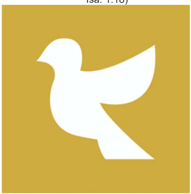
Baptizer With the Holy Spirit

"For John truly baptized with water, but you shall be baptized with the Holy Spirit ... you shall receive power when the Holy Spirit has come upon you; and you shall be witnesses to Me in Jerusalem, and in all Judea and Samaria, and to the ends of the earth." -Acts 1:5,8, NKJV (John 14:16-17, Acts 2:4, Acts 8:17, Acts 10:44-46, 1 Cor. 3:16)